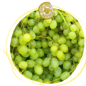
GREEN GRAPES $30 PER BOX