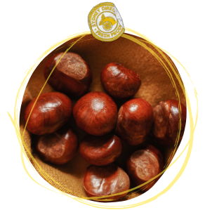
CHESTNUTS $5 PER KG