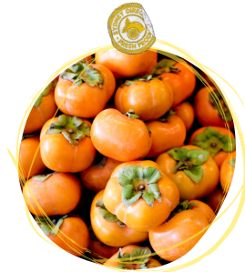
PERSIMMONS $18 PER TRAY