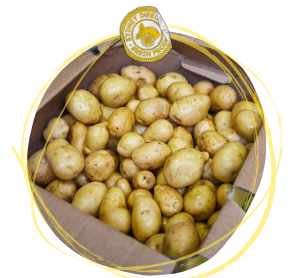
ANDEAN SUNRISE POTATOES $30 PER BOX