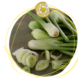
BABY FENNEL $18 PER BOX