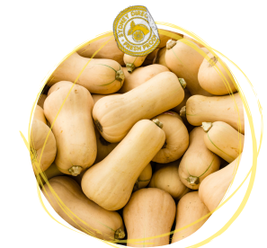
BUTTERNUT PUMPKIN $18 PER BOX