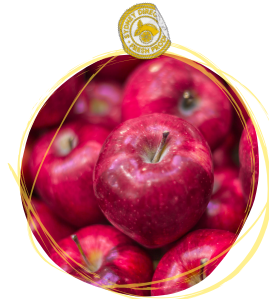
BABY ROCKIT APPLE $18 PER TRAY