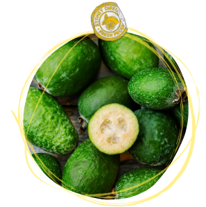
FEIJOA'S $28 PER TRAY