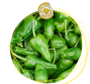
PADRON PEPPERS $10 PER KG