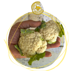
BABY CAULIFLOWER BOX $24 PER BOX