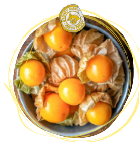
CAPE GOOSE BERRIES $4 PER PUNNET