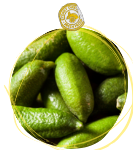
FINGER LIME $4 PER PUNNET